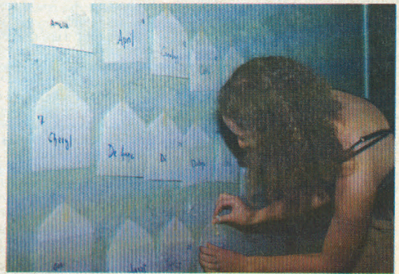
Amy Eiferman, posting envelopes with messages from speed daters to each other.