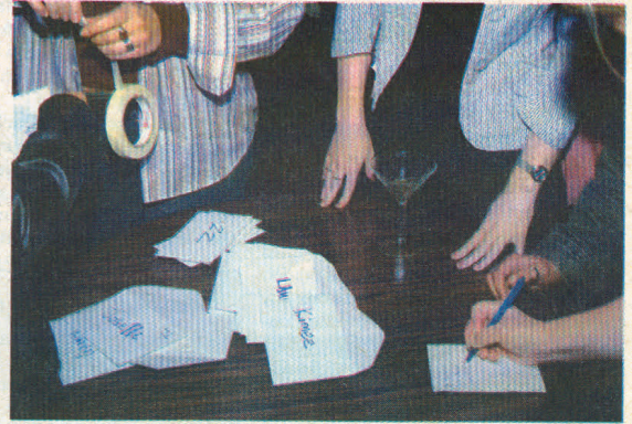
2005 Boston Dyke March Organizing Committee, stuffing envelopes for speed dating participants.