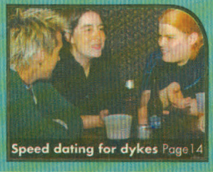
Speed dating for dykes Page 14