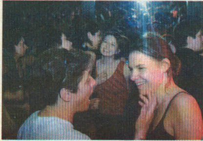
More post speed date dancing.